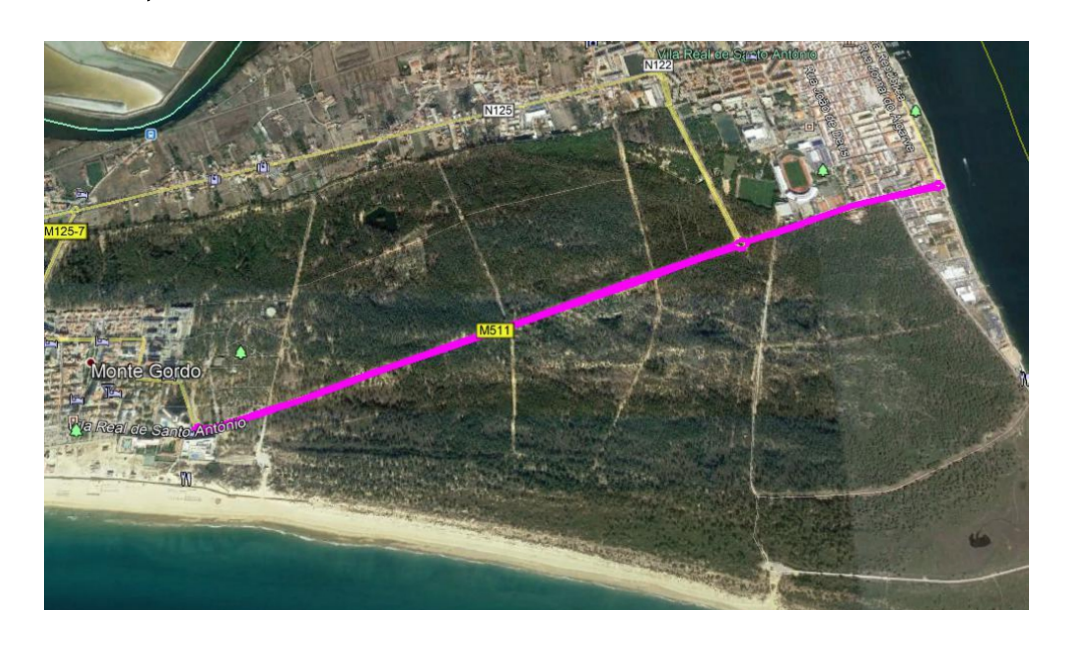
Time trial: 6,1k on a flat route: