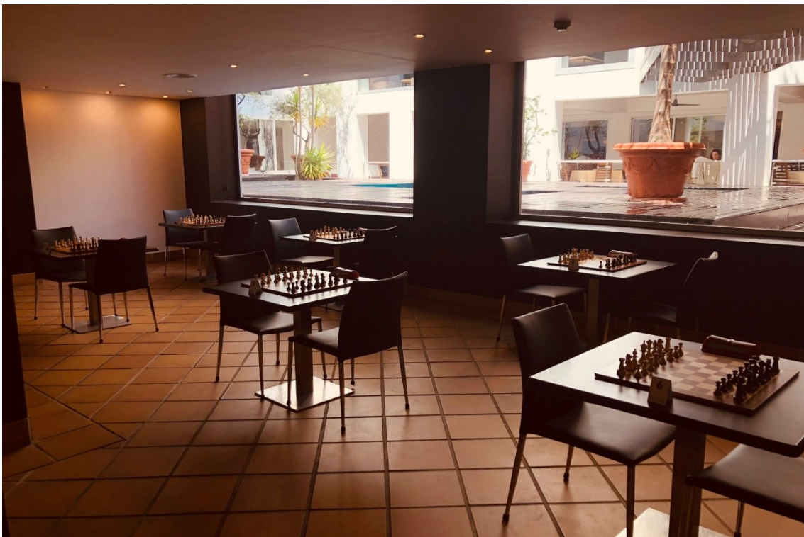
Yellow Praia de Monte Gordo Hotel was the venue for the chess competition.

Medigames 2022 – World Medical & Health Games ( www.medigames.com ) took place in Vila Real de Santo António in the first week of July, combining twenty two sports, chess among them.