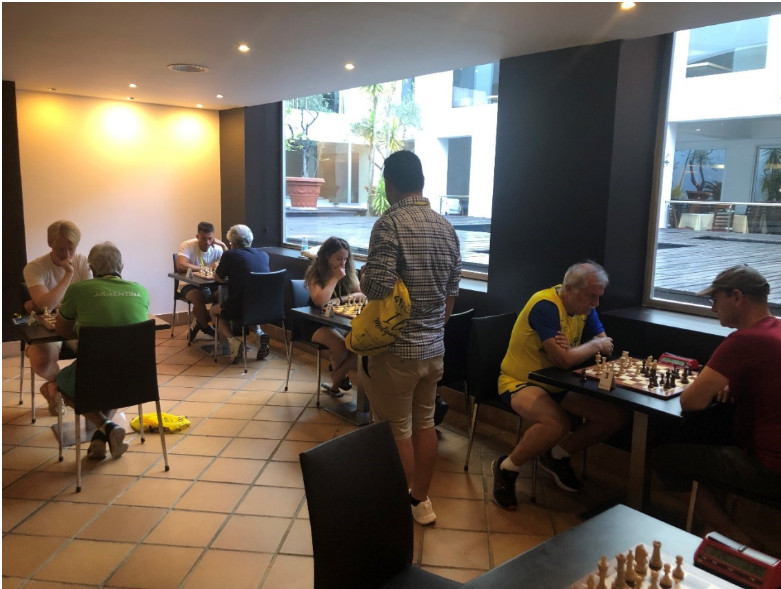
First round games