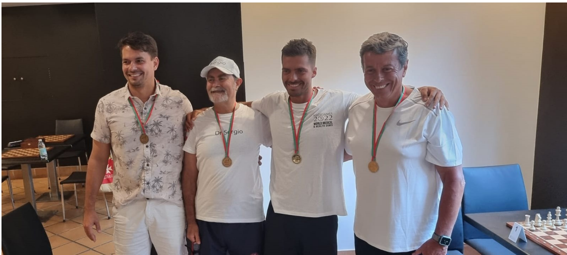
Medigames 2022 | Chess Medalists